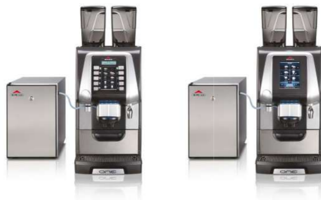
One Quick Milk Keypad + Quick Milk fridge