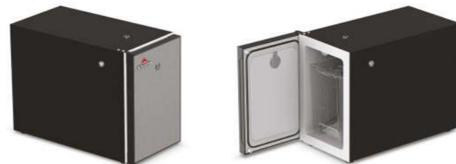
Quick Milk fridge