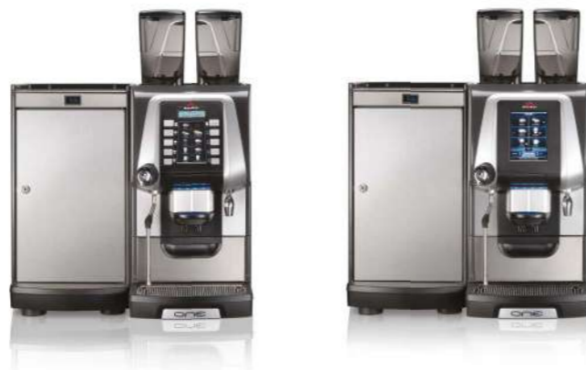
One NMS+ Keypad + KS9 Fridge