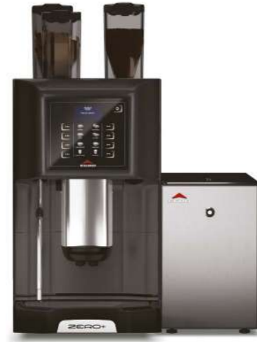
Zero+ Quick Milk Pro + Quick Milk fridge