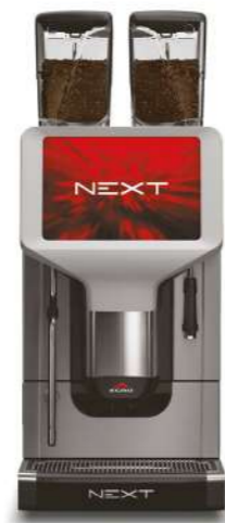
Next Pure Coffee