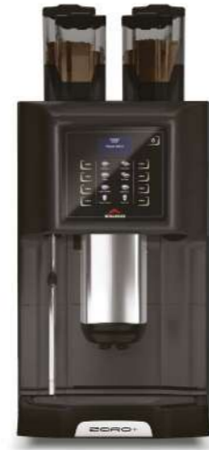
Zero+ Pure Coffee