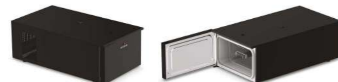
FUM fridge - pump module, milk sensor for all Top Milk and NMS+ configurations