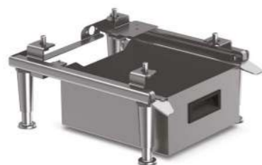
GUM Coffee grounds container