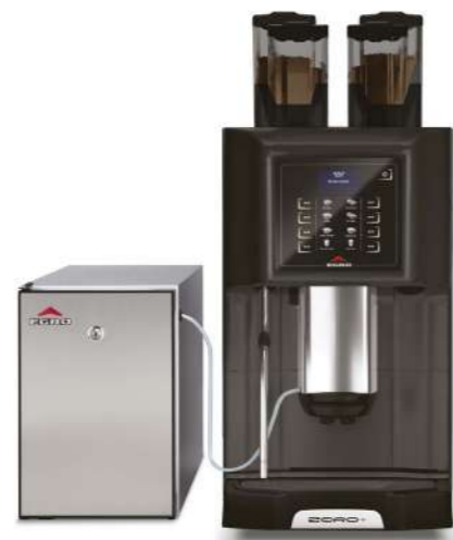
Zero+ Quick Milk + Quick Milk fridge