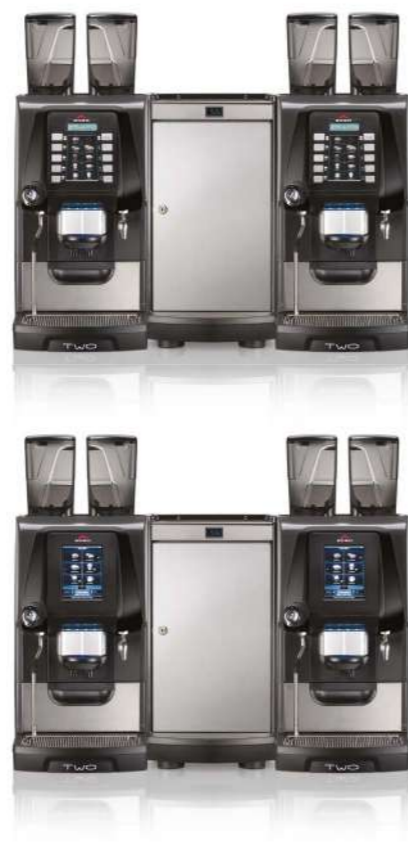
Two Top Milk Keypad