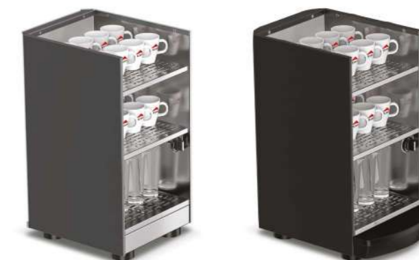
Cup Warmer Next / Zero+

COLORS ● black / inox (Next, Zero+) ● black (One, Next)