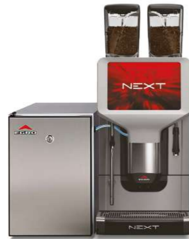
Next Quick Milk + Quick Milk fridge