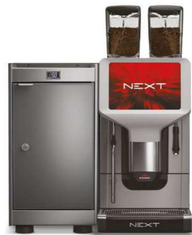
Next NMS+ + Next Fridge