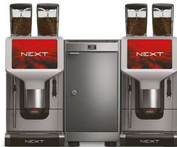
Next X2 NMS+ + Next Fridge