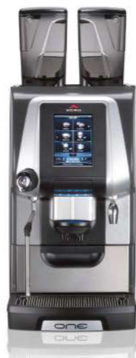
One Pure Coffee Touch