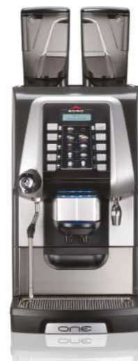
One Pure Coffee Keypad