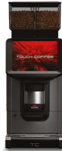
Touch Coffee with built-in Coffee Cooler