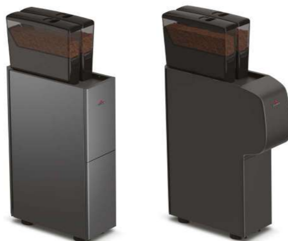
Powder Module Next

COLORS ● black / inox (Next) ● black (One, Next)